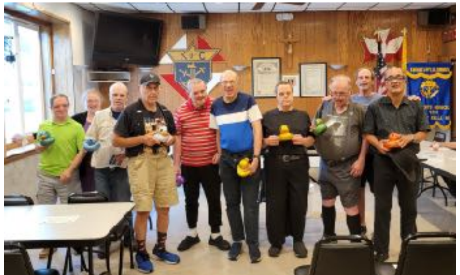
Hartfel House Recipients